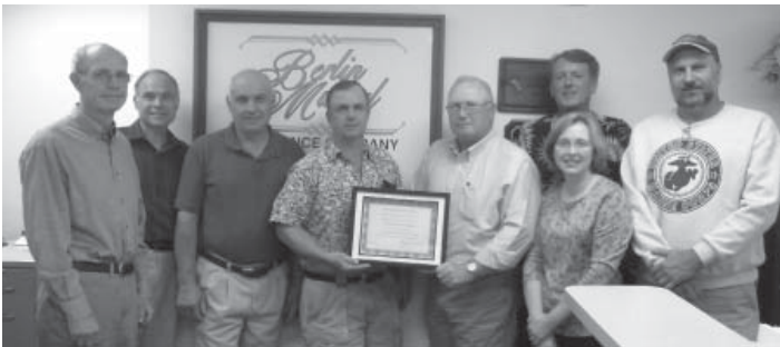
Berlin Mutual — 135 Years