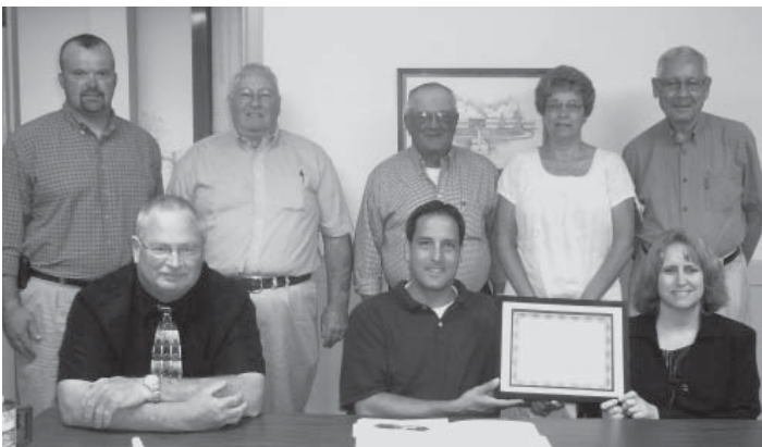
Watseska Mutual — 135 Years