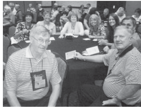
—Convention Highlights continued on next page