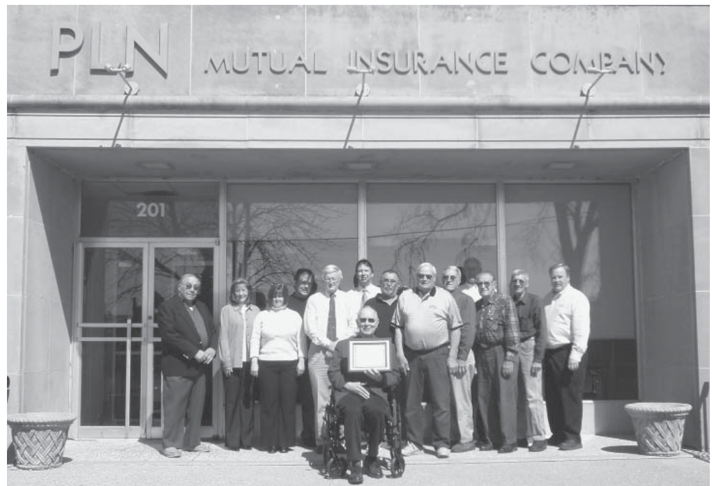
PLN Mutual — 145 Years

We are pleased to recognize the Mutuals pictured for achieving Milestone Anniversaries. Congratulations!