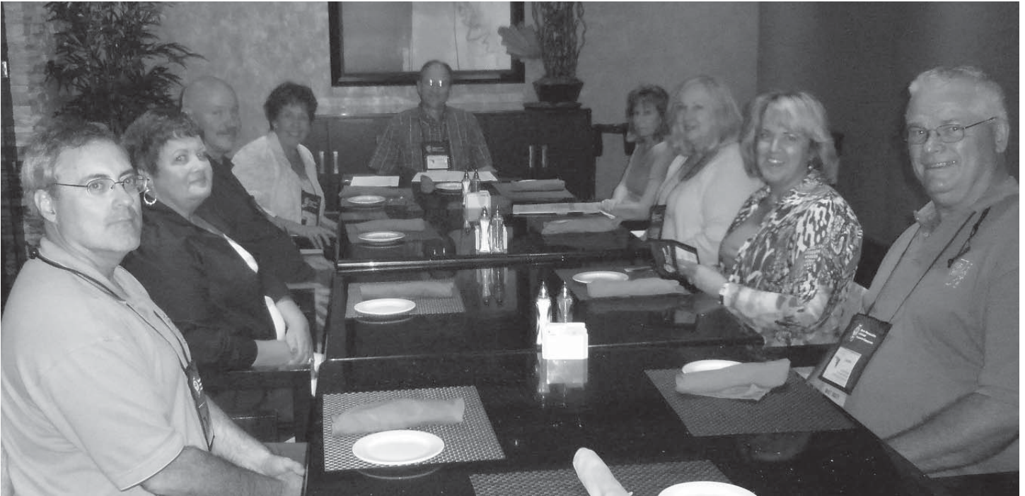
IMPACT Society Meeting.