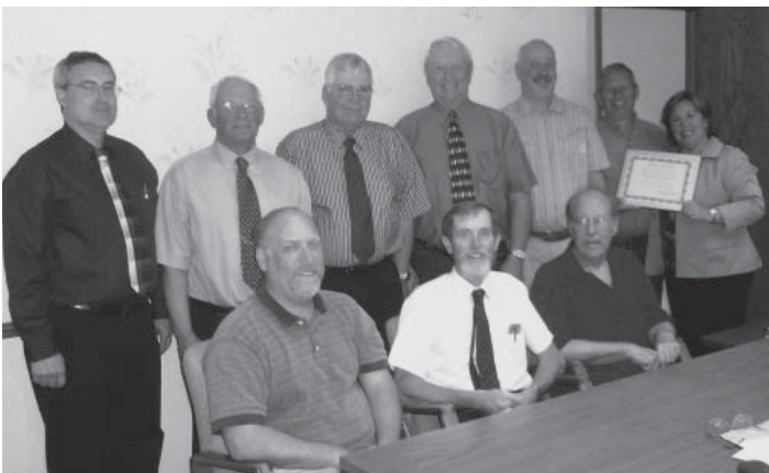
Town & Country Mutual — 115 Years