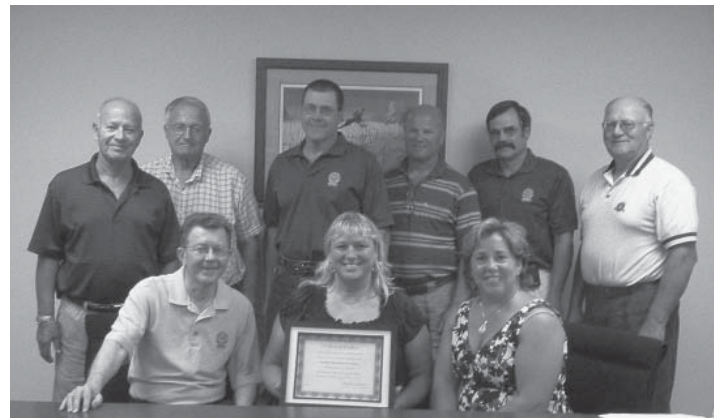
Mendota Mutual — 135 Years