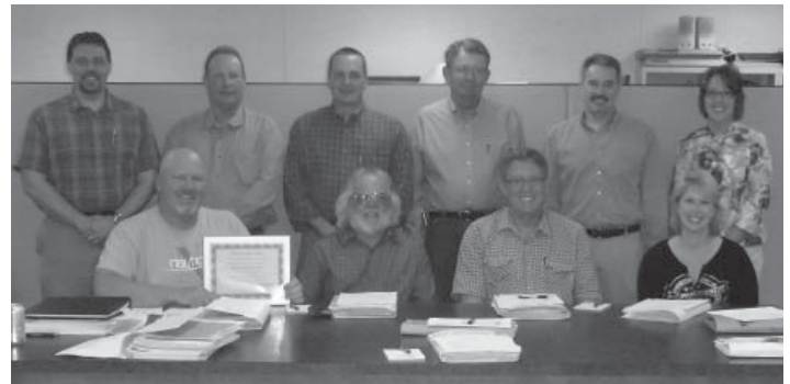
Hamlet Mutual — 135 Years