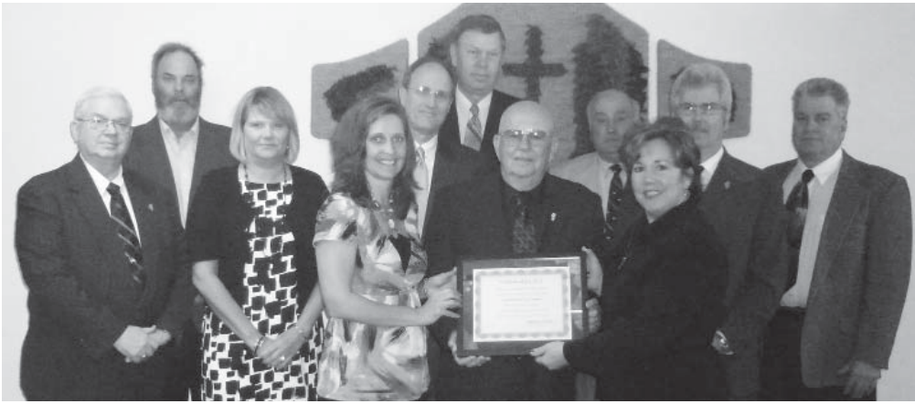
Svea Mutual — 145 Years