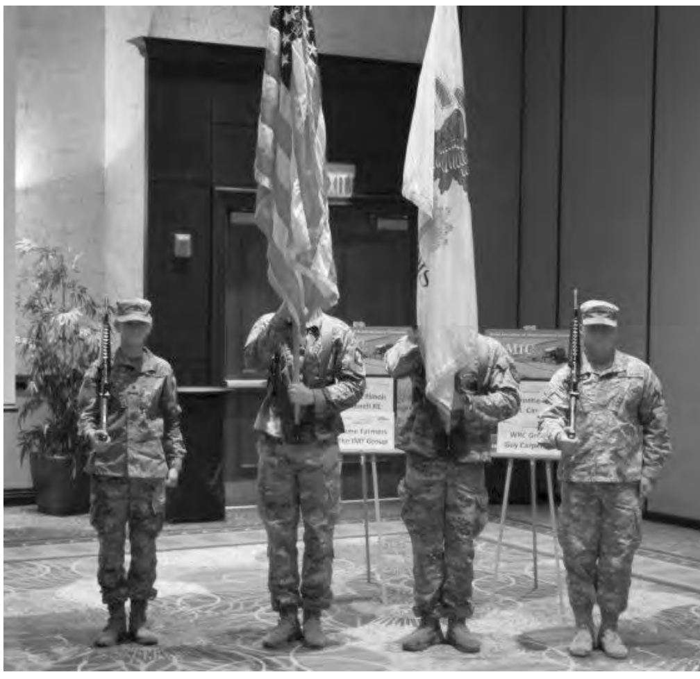
We had the honor of having the ROTC Cadets from ISU present colors during our opening ceremony.