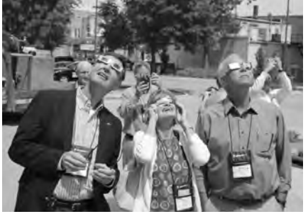
Things were really looking up when the 2017 Convention and Trade Show conveniently coincided with The Great American Eclipse on August 21st! IAMIC provided protective eyewear to all attendees, and near the time of totality we took a break to go outside and view this historic and remarkable event. ( Yes, we all got "mooned" and loved every minute of it! )