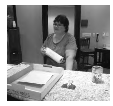
From registration to the conclusion of Convention, IAMIC members were on a not-so-secret mission to "Get Smart" and acquire new knowledge from faculty and peers.