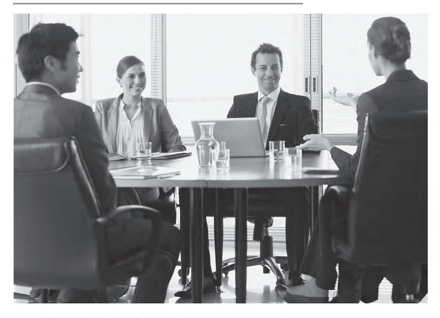
SUPERIOR SERVICE. TRUSTED RELATIONSHIPS.

Grinnell Mutual's reinsurance business has always been about lasting partnerships that help ensure your future and your policyholders'. Over 100 years of great service — and still counting.