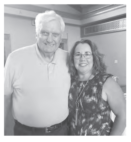
Daviess Mutual AND celebrated is 90th