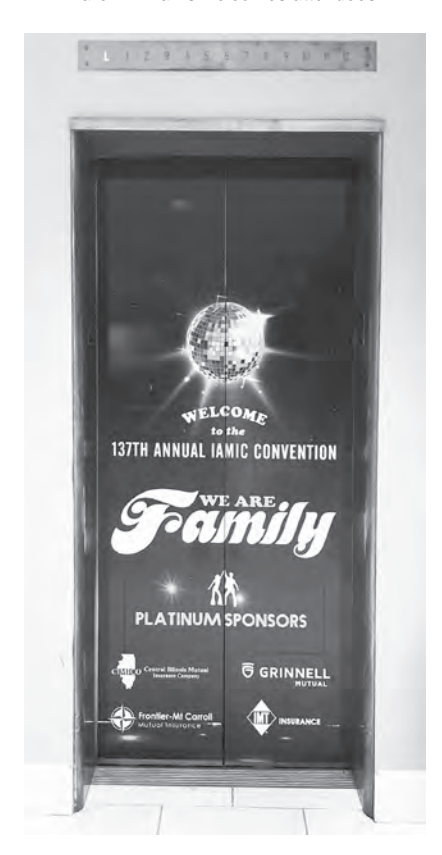
Even the hotel elevator doors were customized to celebrate the 137th Annual Convention!