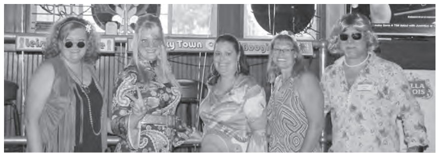
continued on next page