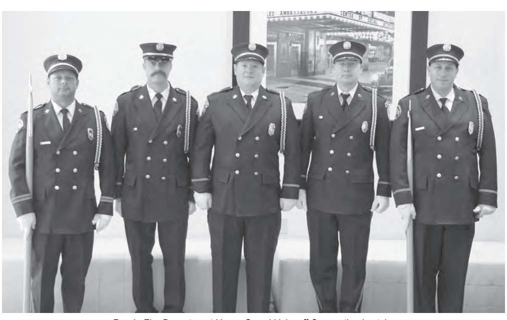
Peoria Fire Department Honor Guard kicks off Convention in style.