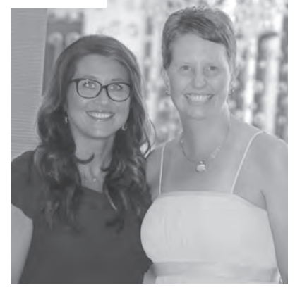
continued on next page