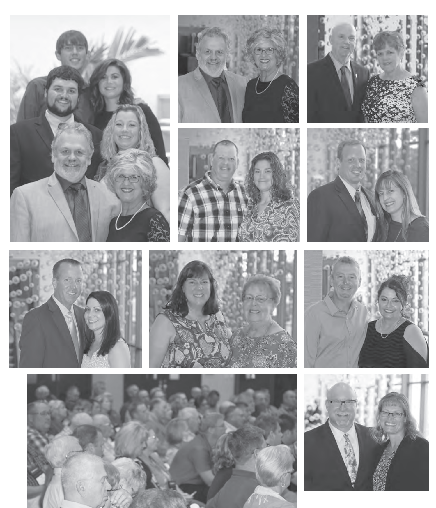
Left: The General Session was well-attended and informative.