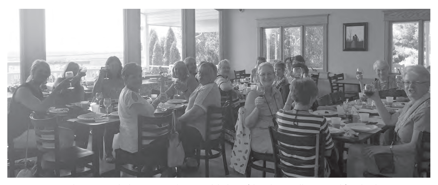
On Monday, August 13th, the IAMIC Auxiliary visited the beautiful Mackinaw Valley Vineyard for a luncheon . The 86-acre property boasts 15 acres of grapes, as well as many outdoor deck areas and paths to take a leisurely stroll and get away from the hustle and bustle of today's hectic world. Thank you to Town & Country Mutual for sponsoring this event.