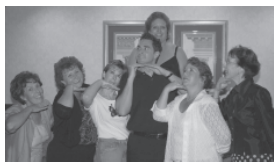
2006 Convention Highlights