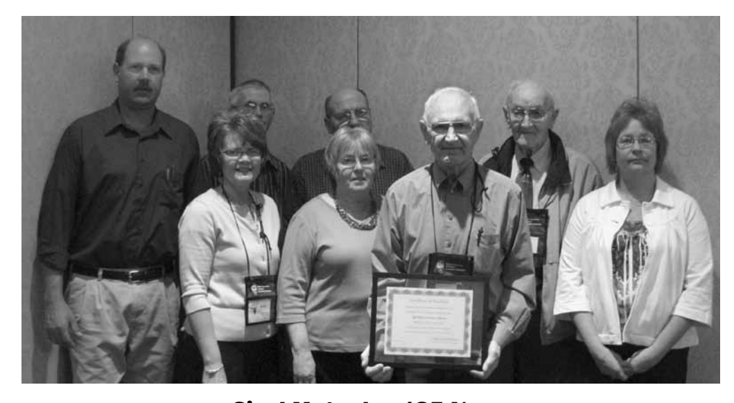
Sigel Mutual — 125 Years