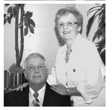
-Convention Highlights continued on next page