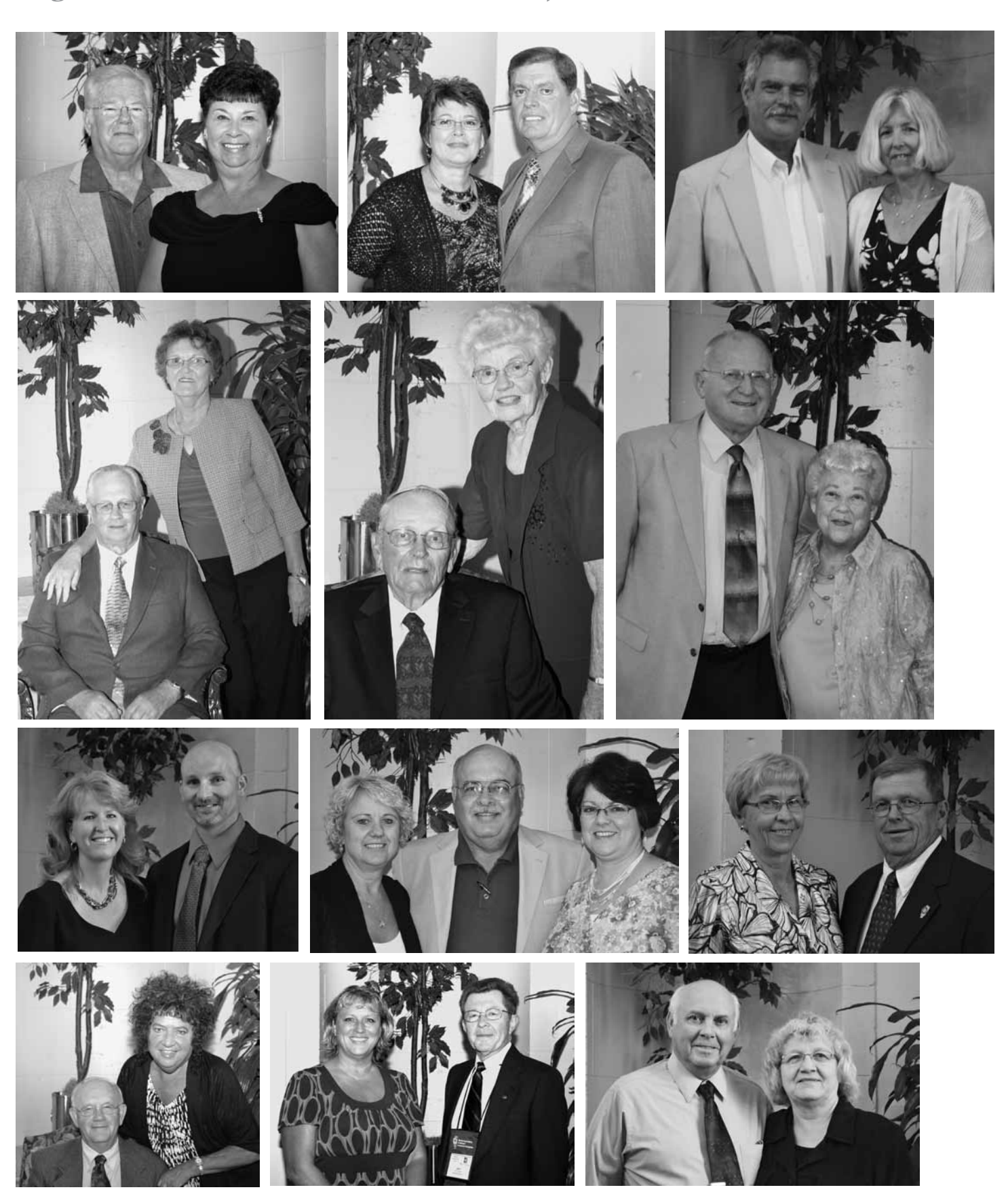
-Convention Highlights continued on next page