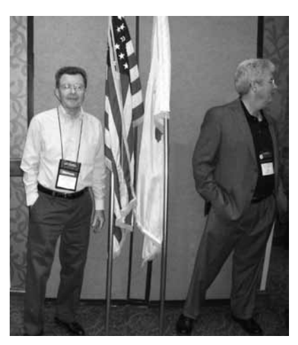
Flagbearers watch for their cue to begin.