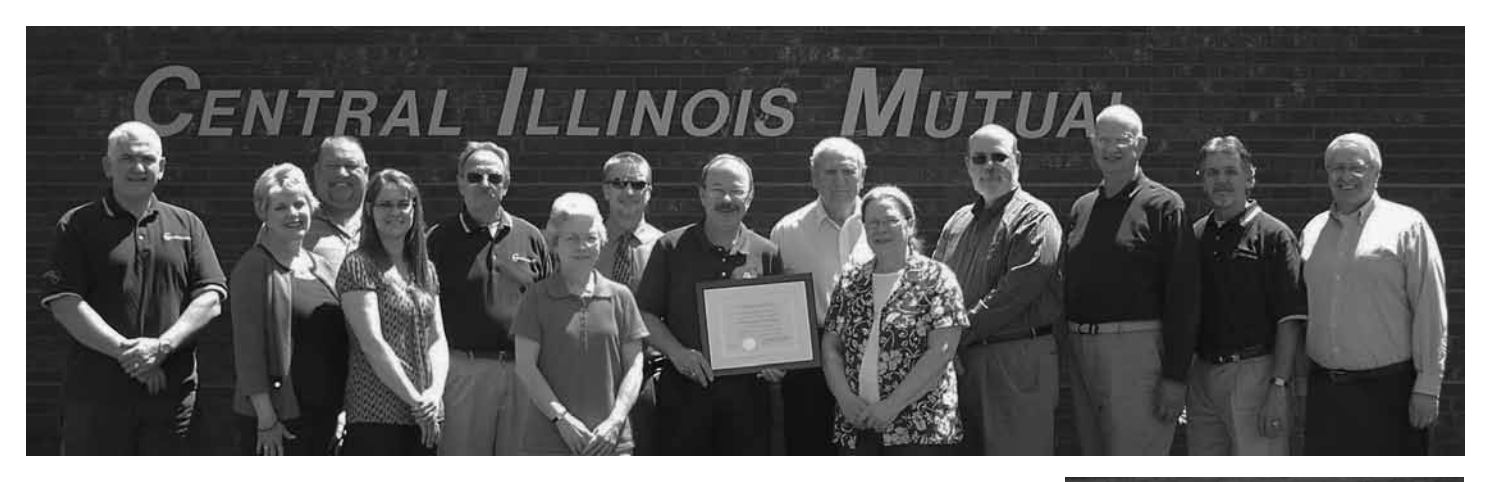
Central Illinois Mutual — 120 Years

If your Mutual is celebrating a five year milestone in 2013, watch for a request from the IAMIC office to attend one of your board meetings to present your company with an Anniversary Plaque!