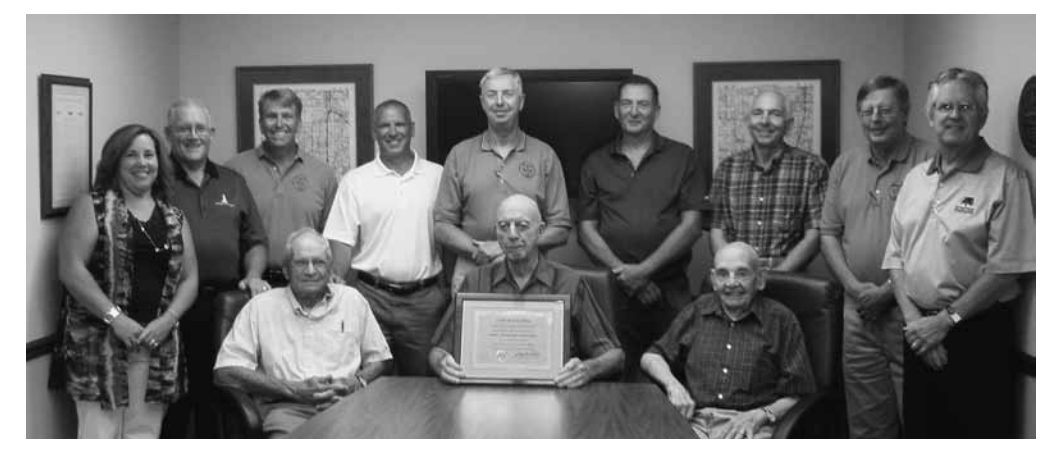
Dunham & Chemung Mutual — 130 Years